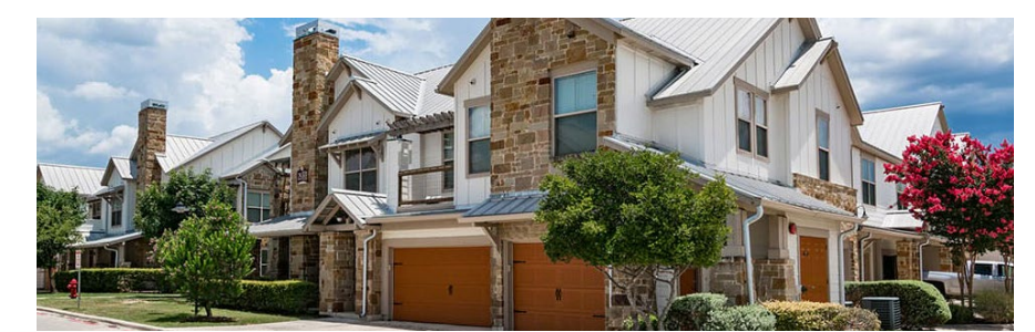
Acorn 2.0 Multifamily Portfolio $2B purchase price*

*Represents BREIT's purchase price at share.