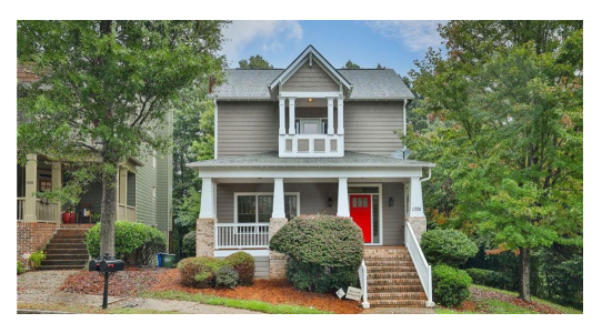
Home Partners of America $6B purchase price*