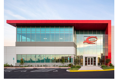
QTS Data Centers $3B purchase price*