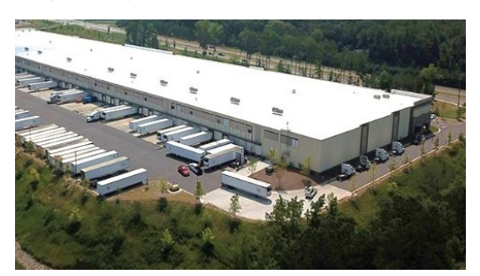
Canyon 2.0 Industrial Portfolio $2B purchase price*